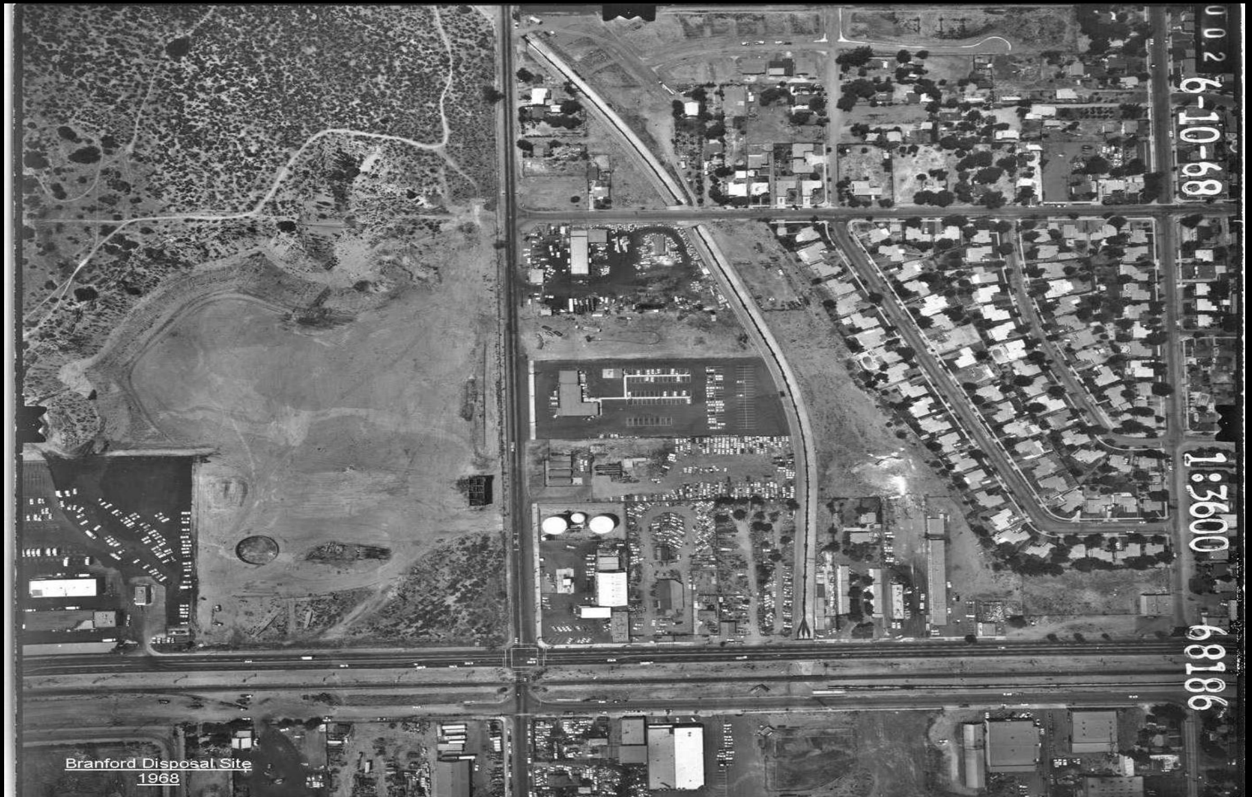
Branford Disposal Site 1968